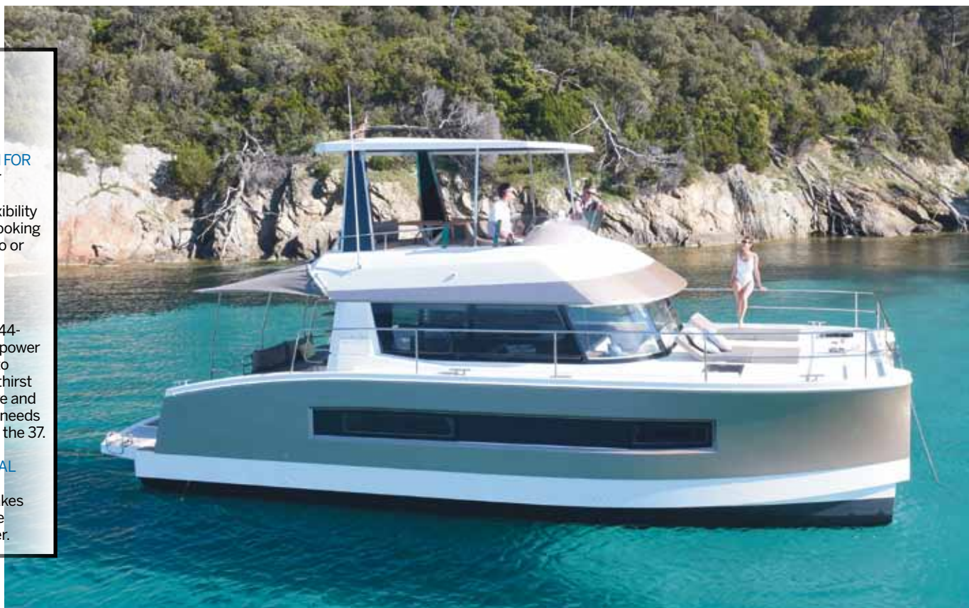
Aboard power cats like the 37, social spaces are the name of the game, from the swim platform to the bow and the flying bridge.

AN OPTIONAL 1,000-watt windlass makes sense for the active cruiser.