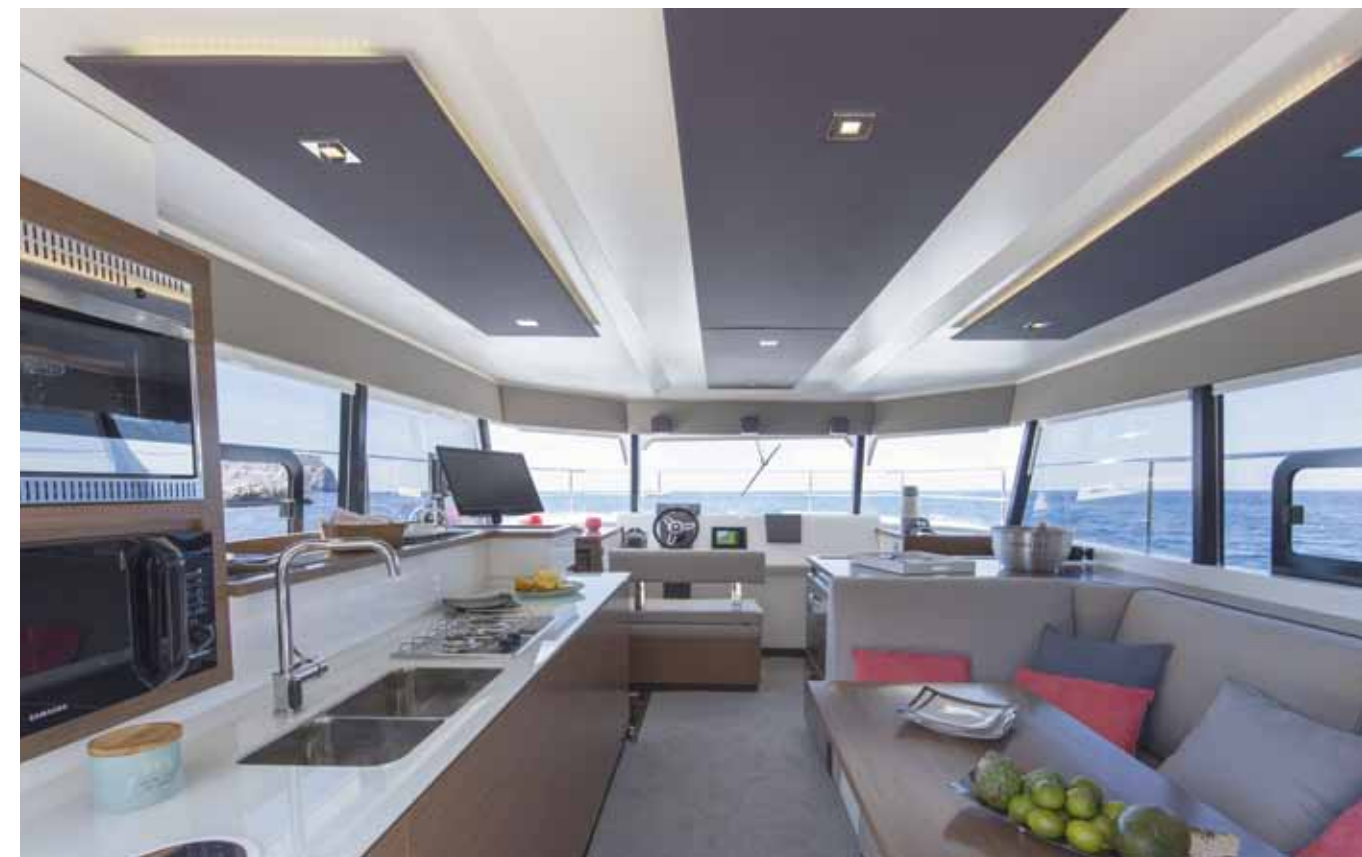
Note the sightlines around the saloon: Except for the port aft corner housing the galley, it's wall-to-wall windows on the world.

The one traditional knock on cats is that the staterooms are small and narrow. Not so on the Fountaine Pajot 37. The starboard hull houses two guest staterooms plus a head, and I don't foresee any complaints